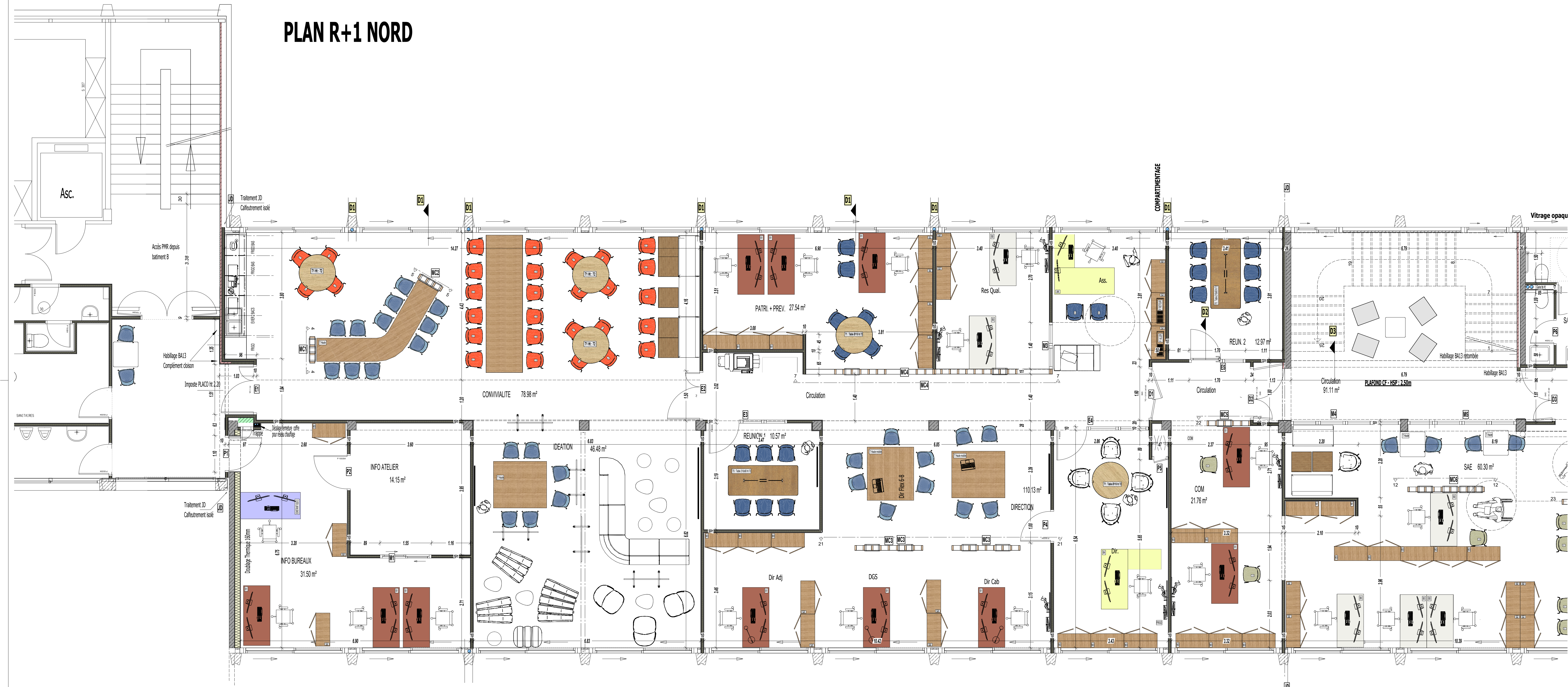
PLAN R+1 NORD